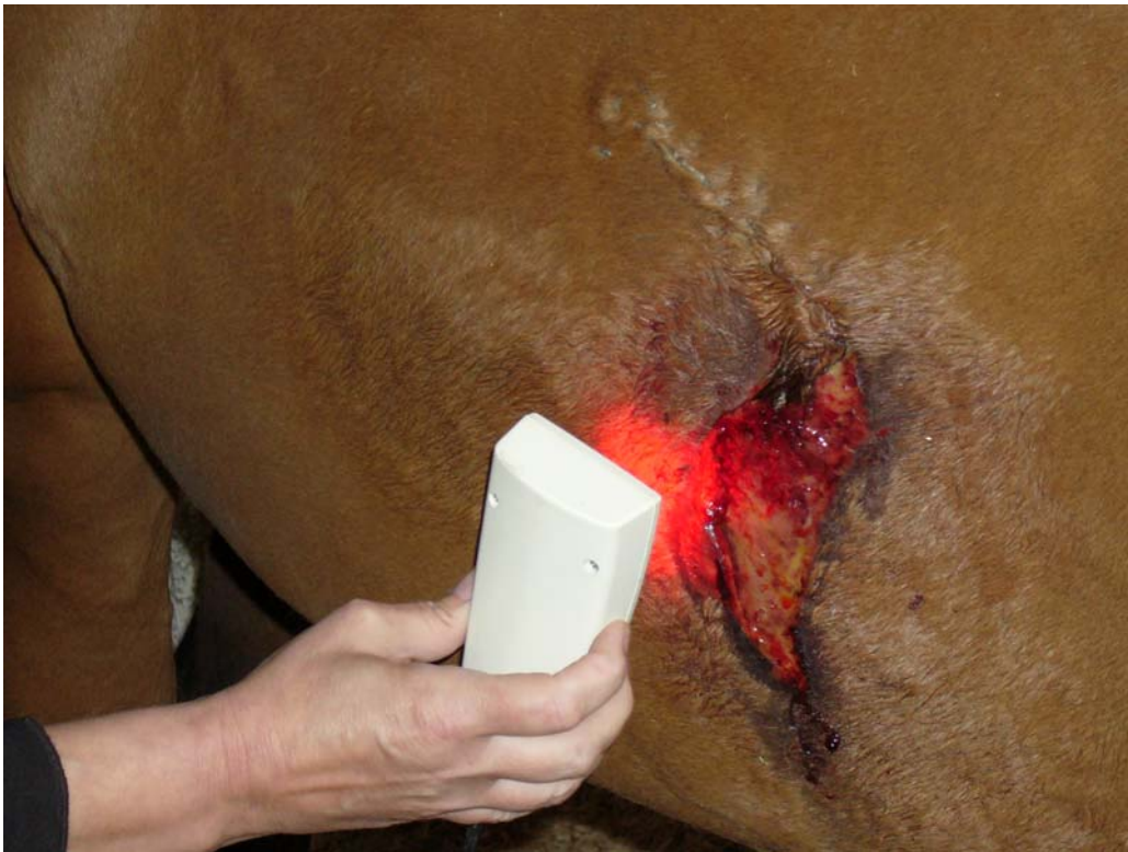
Fig. 5 Once the infection is cleared, red laser is used to stimulate skin healing.