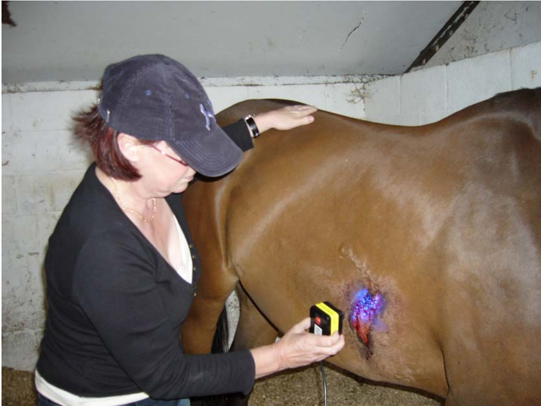
Fig. 4. Using blue light therapy on the infected wound