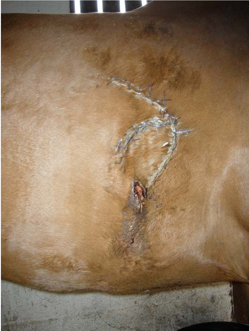
Fig.3 The wound after it had been stitched and stapled by the vet.

In cases of infected wounds the latest physiotherapy treatment is by way of “blue light therapy”. Blue light therapy is being increasingly used in the treatment of humans for such conditions as acne and there is some exciting research being carried out on the effects of blue light therapy on melanoma. The blue light spectrum used in treating infected wounds targets the bacterial cells and kills those without killing the skin cells. Once the infection has been treated normal red laser therapy can be used to stimulate the growth of skin cells.