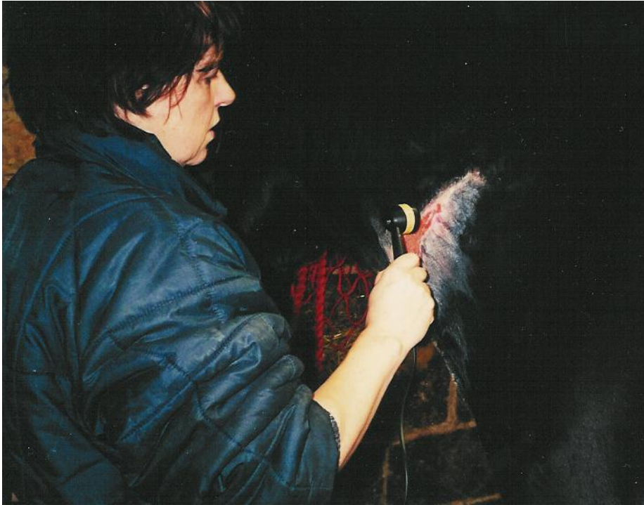
Fig. 2 Using laser around the edges of the wound

I brought him back into work using a Pessoa training aid and long reins, utilising gymnastic exercises over poles. My goal was to strengthen the muscles around the shoulder to support the forehand and provide an easy foreleg action. To achieve this the horse has to be made to work through the back and up through the shoulder. By working him on the Pessoa in a long and low outline with his head lower than his withers this makes the back supple and frees the shoulder. This horse improved so much that within a month I was able to get his owner back in the saddle and the horse is now back competing again.